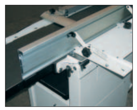
Double guided jointing fence, tilts at the table