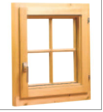
Clean surfaces due to 3-knife cutter head