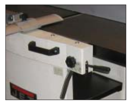
Eccentric rapid adjustment of the jointer tables