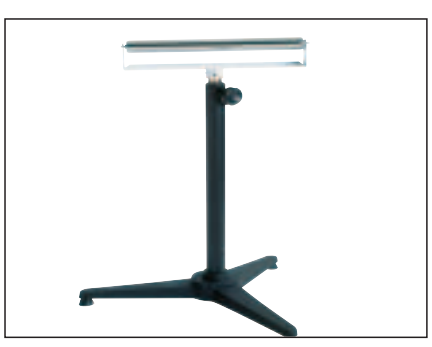
Helping stand for simple machining of long workpieces