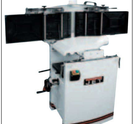
Rapid change from planing to thicknessing